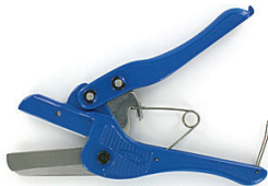
WT-1 Cutting Tool