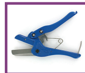
WT-1 – Duct Cutting Tool

Complete selection of accessories and tools for installation: see pages D-8, 9