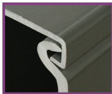
Flush cover design with maximum grip.